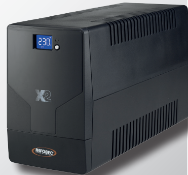
X2 LCD Touch 1250/1600/2000