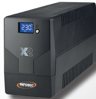
X2 LCD Touch 500/700/1000