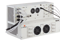
TDH 800 Cabinet - Main Unit Art. No.: 692890 EAN Number: 5702666928906