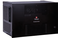
TDX Black Edition Main Unit Art. No.: 492091 EAN Number: 5702664920919