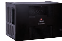
TDX Black Edition Main Unit Art. No.: 492091 EAN Number: 5702664920919