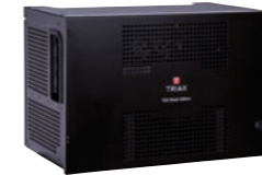
TDX Black Edition Main Unit Art. No.: 492091 EAN Number: 5702664920919