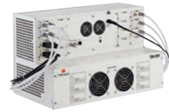
TDH 800 Cabinet - Main Unit Art. No.: 692890 EAN Number: 5702666928906