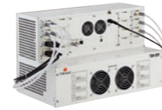
TDH 800 Cabinet - Main Unit Art. No.: 692890 EAN Number: 5702666928906